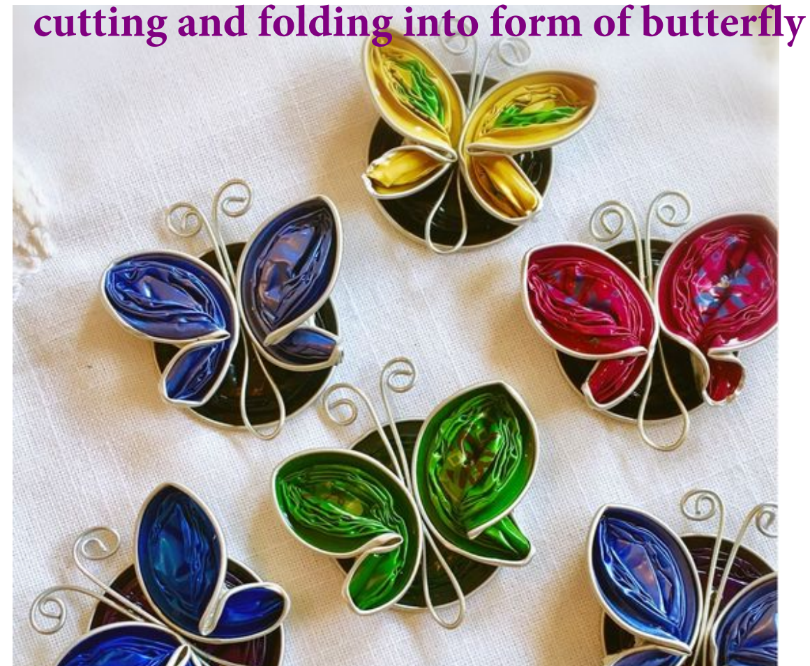
cutting and folding into form of butterfly