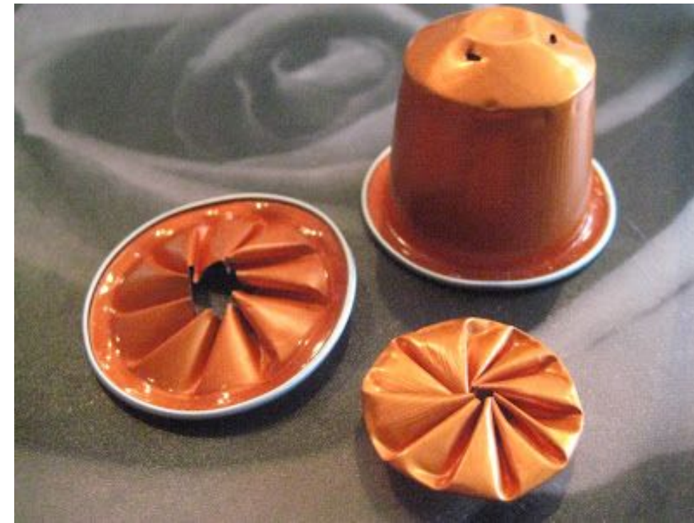
cutting and twisting