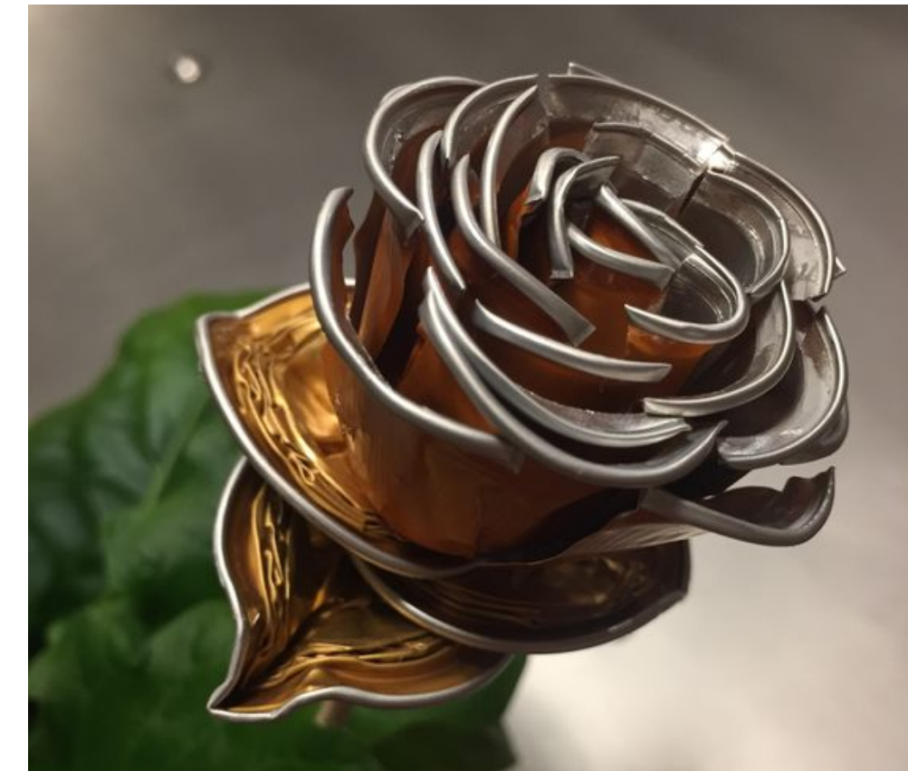
cut and arranged into rose