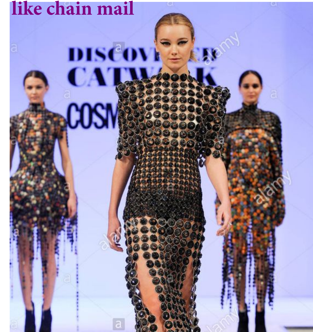
linking flattened pods, connecting like chain mail